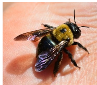
EASTERN CARPENTER BEE: APPROXIMATELY ONE INCH LONG, SHINY METTALIC WINGS, WITH SHINY BODIES

cases. They then start creating chambers depositing an egg with a store of pollen, then closing off that chamber and beginning the whole process over again until