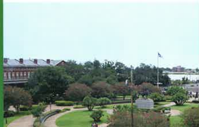
JACKSON SQUARE, FRENCH QUARTER, NEW ORLEANS